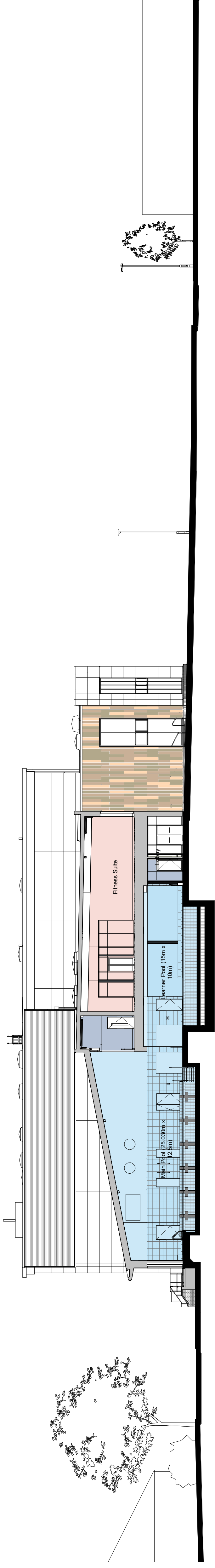
Section C 1: 200